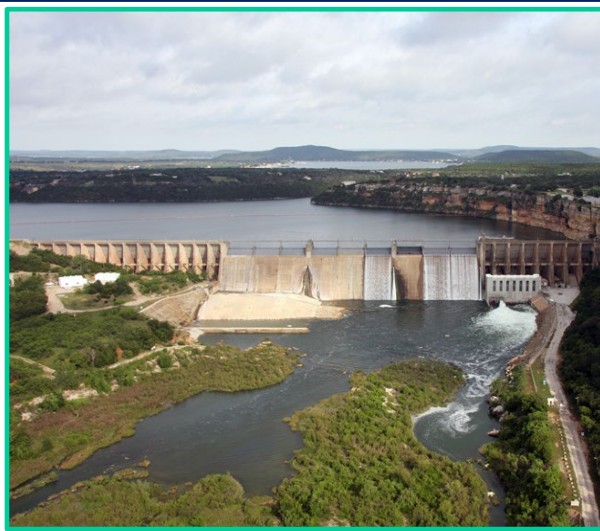
Morris Sheppard Dam Possum Kingdom Lake

The Risk-Based Asset Management and Capital Planning Program formalizes the process to define the relative risk posed to operations from any single asset, as well as assess the BRA's risk profile presented by all assets. The program will leverage data collected from operations, financial software system and other various sources to integrate into an enterprise resource planning system. This will help improve decision making on asset renewal through improved prioritization of assets across BRA and also improve long-term capital forecasting efforts through improved assessment of renewal needs.