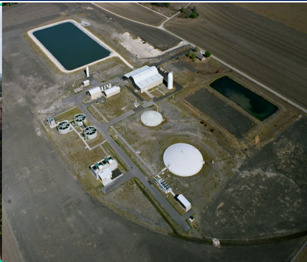
East Williamson County Water System

The Risk-Based Asset Management and Capital Planning Program formalizes the process to define the relative risk posed to operations from any single asset, as well as assess the BRA's risk profile presented by all assets. The program will leverage data collected from operations, financial software system and other various sources to integrate into an enterprise resource planning system. This will help improve decision making on asset renewal through improved prioritization of assets across BRA and also improve long-term capital forecasting efforts through improved assessment of renewal needs.